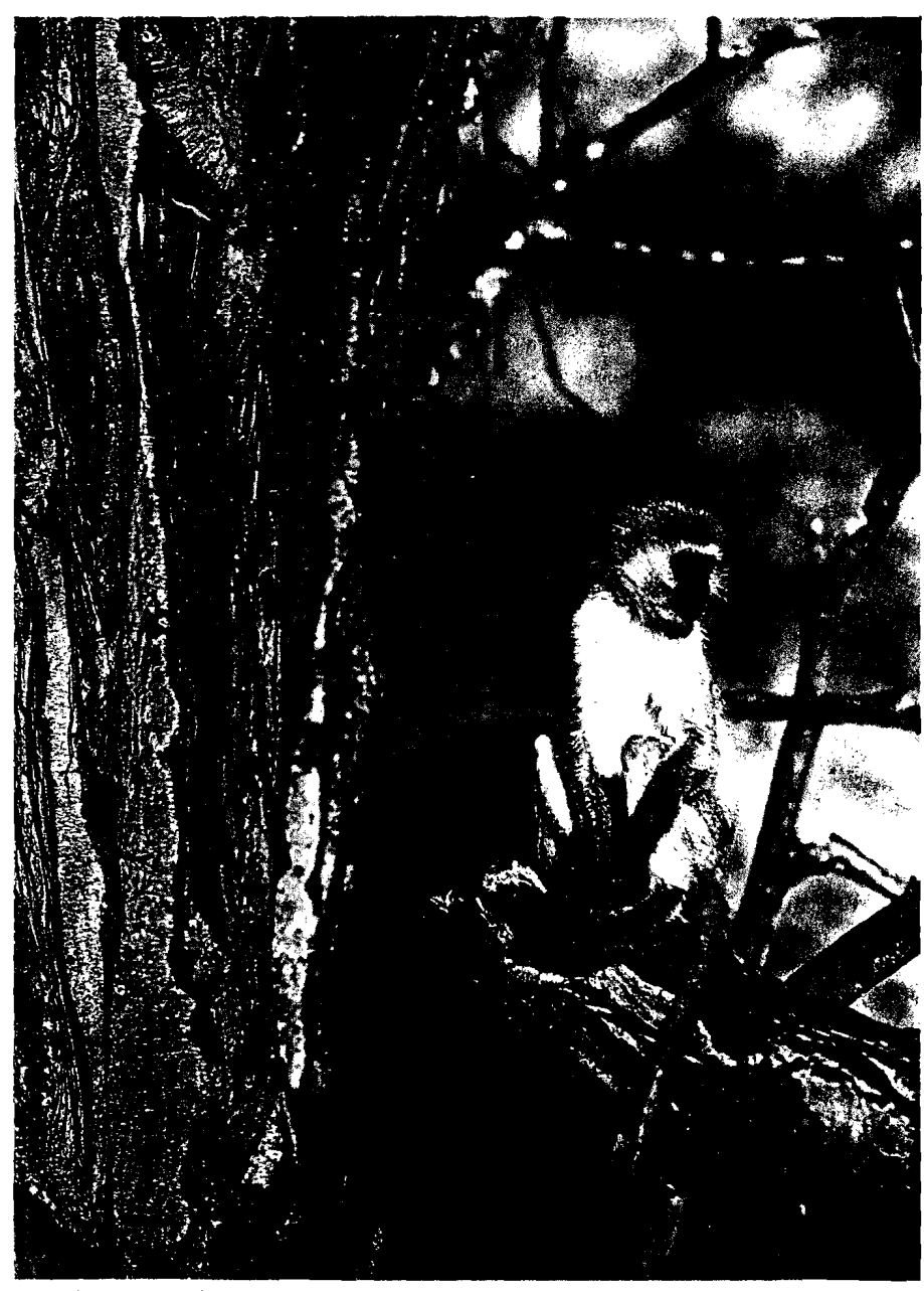
An infant vervet clings to its mother, opposite page, in Kenya's Amboseli National Park. Vervets prefer to sleep in fever trees, above, whose many vertical branches may deter leopards from climbing them.

Anyone who visits the numerous national parks in East Africa quickly learns that dangers abound there. Parched bones liberally litter the ground. Many belong to gazelles, wildebeests, and other ungulates taken by lions, hyenas, cheetahs, and leopards. Some smaller animals, however, leave very few bones behind to remind us that they were once dynamic individuals that maneuvered their way around friends and enemies in an attempt to survive and reproduce. Vervet monkeys are the size of